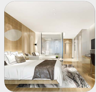
AIRBNB / Hotel Room