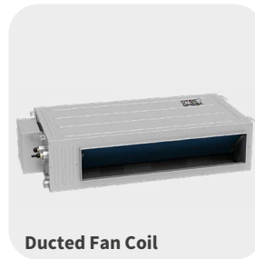
Ducted Fan Coil